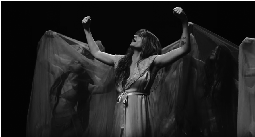
Fig. 3: What do the women receive? Music video still from Big God , Florence + The Machine, 00:00:46.

“You need a big god, big enough to hold your love”, laments Florence Welch, the unveiled woman, singer in the British indie rock band Florence + The Machine, and then adds, “You need a big god, big enough to fill you up”. 1 And while her voice still modulates the “up”, she takes several deep breaths and opens her arms, as if to signal physically her willingness to receive whatever comes (fig. 3).