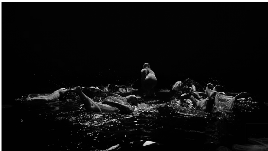
Fig. 4: Getting better after profound sadness. Music video still from BIG GOD, Florence + The Machine, 00:01:57.

We see Florence go through the most extreme emotional depths, where the pain is almost unbearable, but even there hope rises, and she finds a way out of the pain (fig. 6) and to a new strength.