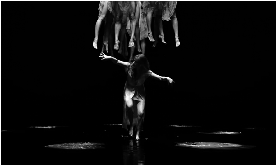
Fig. 6: The way out of the pain. Music video still from BIG GOD , Florence + The Machine, 00:02:17.

respond to a new collective perception” (Belting 2011, 36). Here Belting elaborates Warburg’s idea of recurrent motives and representational strategies and focuses on how the qualities of a specific media – that used to transmit an image – shape the perception of the beholder.