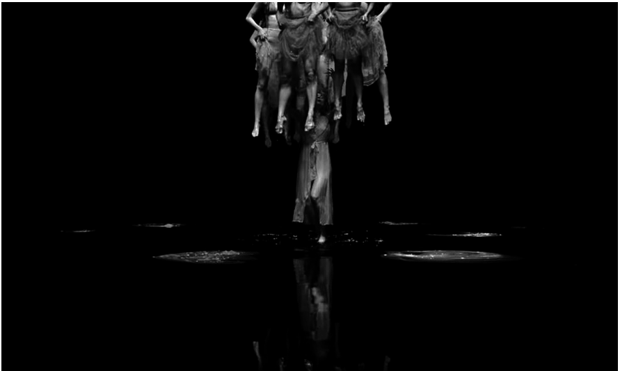
Fig. 5: Rising from the pain. Music video still from BIG GOD , Florence + The Machine, 00:02:12.