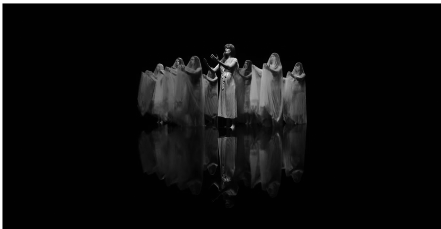
Fig. 2: The women lift their hands, perhaps in an act of adoration. Music video still from BIG GOD , Florence + The Machine, 00:00:14.

Motionless and colourful, a number of women stand in a black void, their reflections appearing in the water at their feet (fig. 1). All but the woman in the centre are veiled in transparent chiffon; the unveiled woman wears a nude-coloured silk dressing gown and underwear. We hear the howling of the wind, then percussion; a piano tune starts as the camera continues to zoom in. The women begin to move their hands towards the black sky (or heaven?) but then let them sink down onto their foreheads in a position of despair (fig. 2).